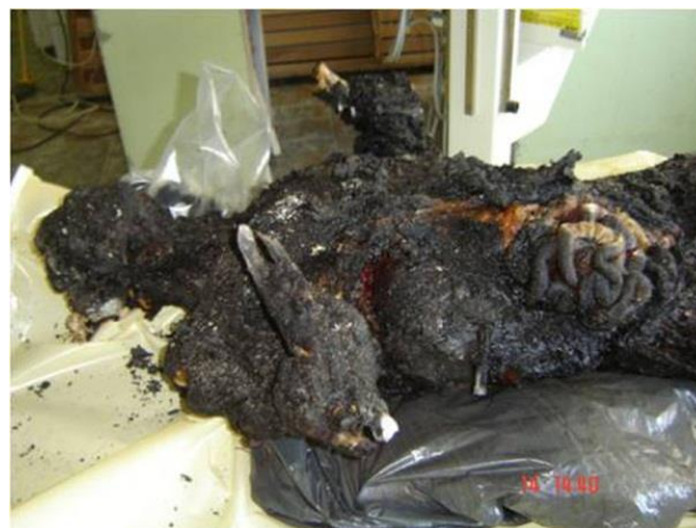
Figure 6. Arrival of the carbonized victim at the Legal Medical Station.

This helps to avoid the need of a robust method of circumstantial identification [20].