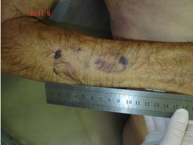
Figure 7. Bite marks to the human identification.

Another way of obtaining DNA material is through the saliva. The saliva can be collected from living people, corpses (in cases of bite marks) (Figure 7), and clothes. It can also be collected from objects found at the crime scene, for example, cigarettes, stamps, glasses. It is also identified by the Woods lamp (filtered ultraviolet light) [4].