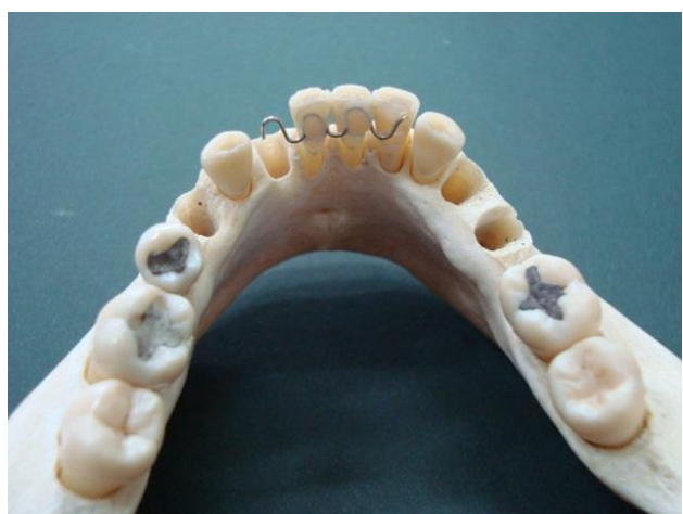
Figure 5. Jaw with contention in anterior teeth showing orthodontic treatment.

The dental identification has some limitations. Having good quality dental radiographies for comparison is not a common practice among dentists, who sometimes do not store the radiographies properly and even lose them. Photographs, study models, and clinical records also are used in this process. Another limitation can come from serious trauma like beheading, which makes the dental identification impossible if the head is not found. Moreover, forensic dental examinations are not done only on unidentified corpses, but also on drowned, polytraumatized and carbonization (Figure 6). Even if the person has already been identified, an examination is done in order to confirm the identification, mainly in cases where the corpse is in an advanced state of putrefaction.