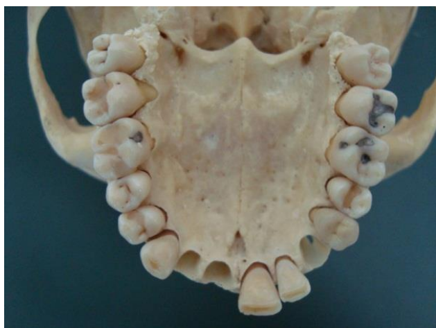
Figure 4. Maxilla with dental elements helping to identify the body.