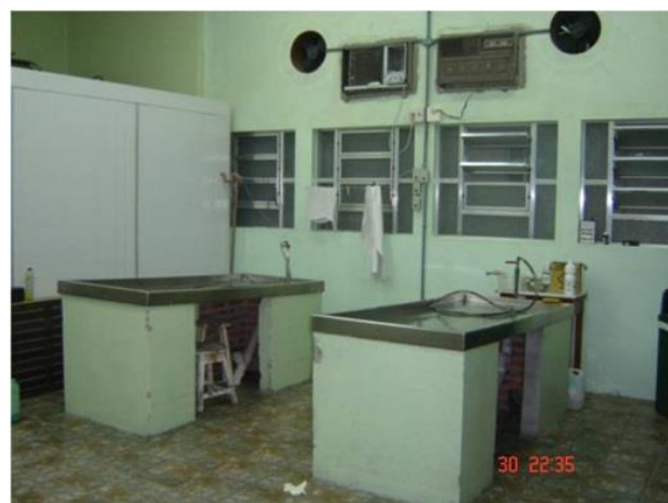
Figure 2. Partial look of the necropsy's room at the Legal Medical Station, Pelotas-RS-Brazil.

As long as the expert is required, the Criminal Department carries out the investigation in the crime scene and the Legal Medical Department removes the corpse, when necessary. After the corpse arrives in the morgue (Figure 2), it undergoes several routine proceedings, including weight and height measurement and a photograph to identify the victim. A form is filled with important information, such as date, time, type of death, corpse's data, decease declaration, further exam requisitions, etc. All these things guarantee that nothing is lost concerning the origin of the body and the proceedings performed on it.