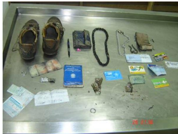
Figure 3. Analysis of the victims' clothes and documents at the Legal Medical Station.

in order to compare them with database files and identify the corpse by dactyloscopic method. This is also the time when the forensic dentist will be called for identify the corpse. The dentist has to fill a form with the corpse data, such as skin color, age, odontogram, and the description of the upper and lower dental arches.